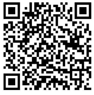
Catholic Welfare Services

<u>DONATIONS</u> FOR THE UNDERPRIVILEGED - Please continue to support the Catholic Welfare Services financially as we minister to the poor and needy in our midst irrespective of race or creed. Parishioners may donate to C.W.S. via S Pay Global by scanning this QR code. Verify that the recipient is 'Catholic Welfare Services' before confirming the transaction. Parishioners may also do online transfer or cash deposit to the following: